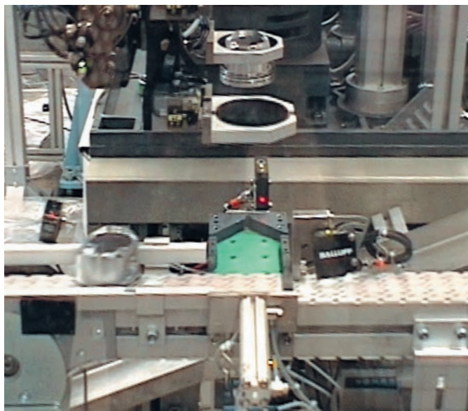
2/ Automatic plant system for the selective hard anodizing of the first ring groove of engine pistons; the process consists of anodizing, rinsing and drying, with a machine cycle time of 12.5 seconds per piston.