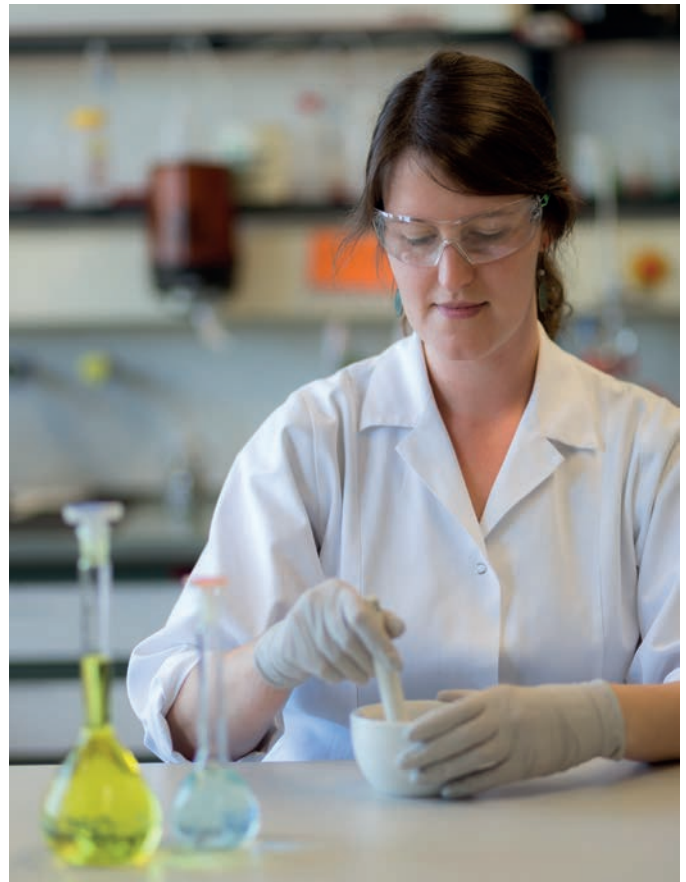
The coatings are developed and tested in our own laboratory.