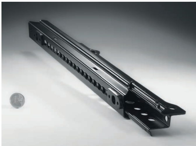
Steel guide rail with cathodic dip coating