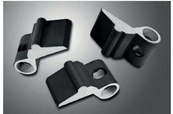
Pendulum plates for swivel chairs, coated with GLISS-COAT® 200-W-60P