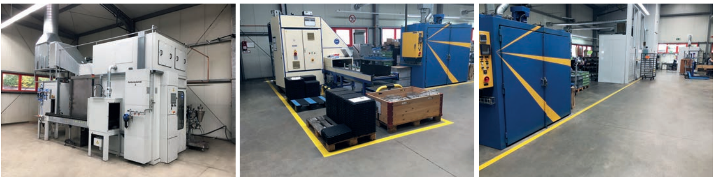
Installations for the coating of round symmetrical components.