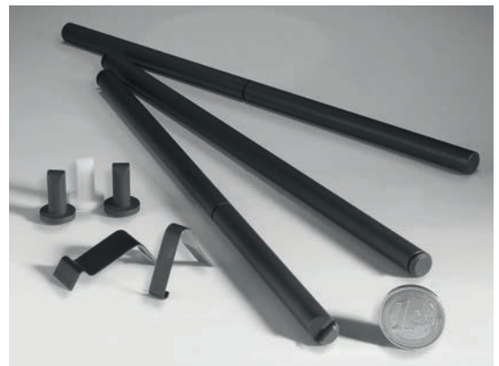
Shafts and springs made of steel, locking bolts made of plastic for car seats, each with GLISS-COAT® surface.