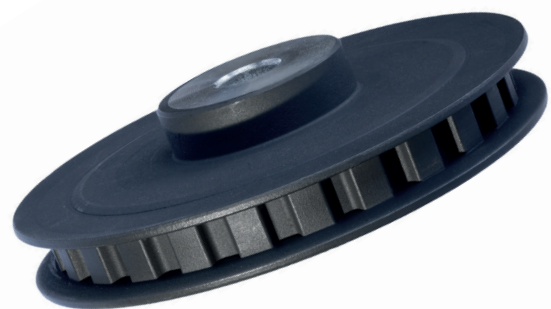
Toothed belt pulley made of an aluminum alloy that has been hard anodized using the HART-COAT® process. The tothing surface was additionally coated with GLISS-COAT®.

hard anodized to improve wear protection. A GLISS-COAT®-coating has also been applied to the tothing surface. The combination layer GLISS-COAT® 2000 produces a higher level of wear protection than each layer could produce individually. Therefore, the combination also improves the service life. A pleasant side effect of the GLISS-COAT®-coating is the reduction of noise.